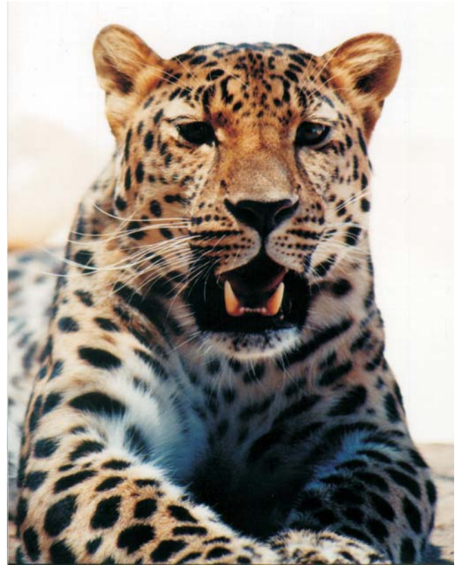
Ktusha and Sasha were both sired by Freddi. Ktusha is now living at the Granby Zoo in Canada, and Sasha is in Louisiana. At left, his new offspring in Tallinn, Estonia.