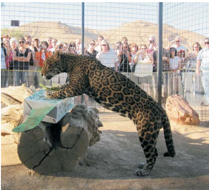
Patrons admire Poncho (jaguar) at play.

We have had a surge in memberships, and we would like to thank both those new members and our continuing members for the support they have shown. It is this community that allows us to exist, and we never forget that. Please keep doing what you have been, spreading the word that we are out here working toward a better world for felines. A special thank you to Westways (AAA) - our Twilight Tour attendance in June broke a new record, and we expect that record to be broken on September 18th, at our final Twilight Tour of the year.