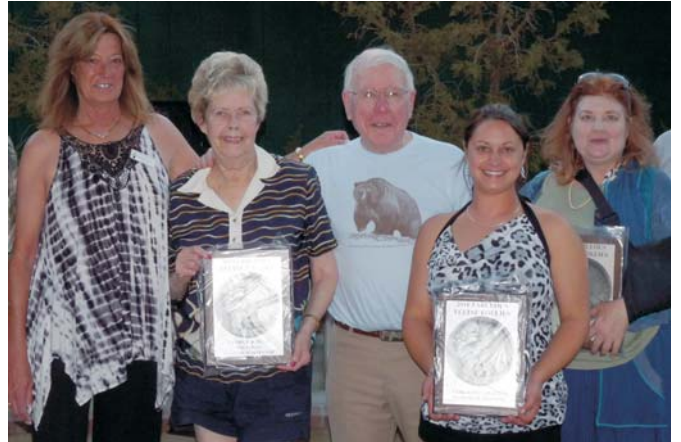
Sandy poses with Platinum sponsors at Follies.

for future generations to learn about these felines and will inspire people to help preserve them in the wild.