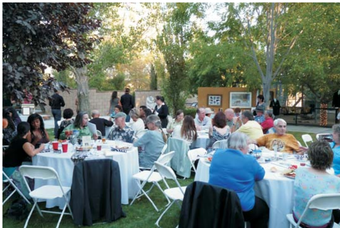
Diners enjoyed the meal alfresco, with the sun setting.