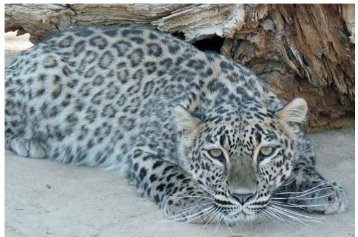
Kiana (Persian leopard) is housed off display, and seems to be stress free and content.

It has been reported that there are less than 1000 Persian leopards now existing in the wild, most in Iran. This is disturbing news since this highly adaptable animal once roamed throughout the caucases region. This is the same region the Caspian tiger once called home. Caspian tigers