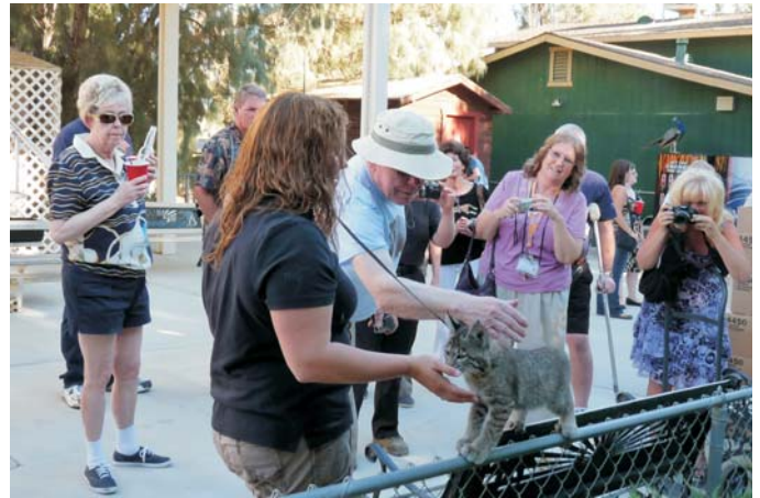
This baby bobcat came out to join the guests at the Feline Follies, courtesy of Zoo to You.

When disaster strikes, it is good to have a back up plan. When gas prices rose, we could not get our cat's food (chicken, meat, fish, etc.) delivered, so we built a large freezer to accommodate a larger order. When the economy dove, our members stepped up, keeping the money constant. When lightning struck in late July 2010, striking a tree and