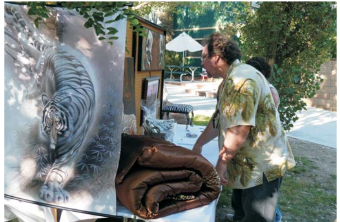
The sale of silent Auction items help fund important projects.