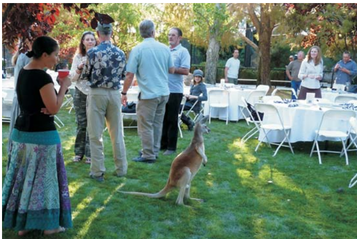
Dennis Hopper (kangaroo) roamed the tables. Zoo to You provided the quality animal ambassadors.